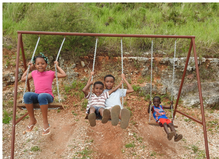
Berlin School students using the new swing set donated and installed by BMR.