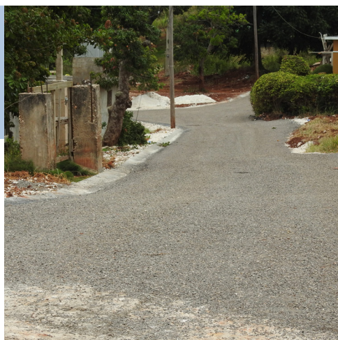
The same section of Smithfield Road after repairs and paving were completed.