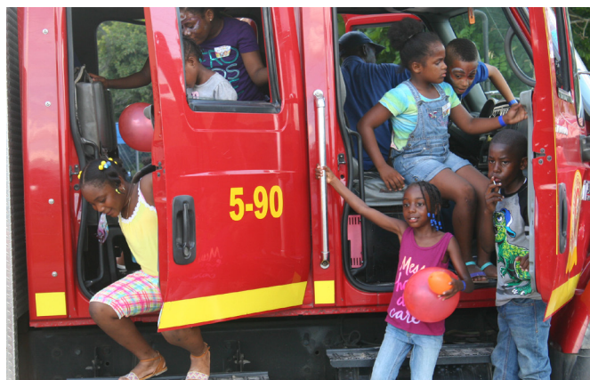
Children explore the Santa Cruz Fire Department's emergency response vehicles during a party at the fire department to celebrate BMR's donation.

In Santa Cruz, temperatures can reach highs of 90 degrees Fahrenheit nearly year-round. In response to a request, BMR donated an air-conditioning unit to the Santa Cruz Fire Station for the comfort of the local firefighters preparing for and returning from emergency calls. BMR frequently partners with this essential community organization, sponsoring treats for children held by the Jamaica Fire Brigade.