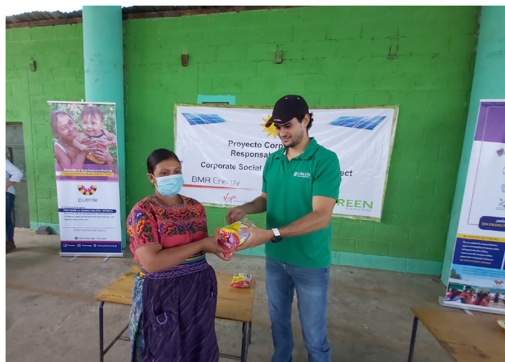
A representative from BMR's Guatemala Green Solar Plant staff presents nutritional support supplements to a local mother.

To assist the community with this matter, BMR joined with a local nonprofit, Puente, whose goal is to help eradicate chronic malnutrition for pregnant women through the provision of dietary supplements. Our investment helped feed more than 100 pregnant women for 10 months, assisting with fetal development and alleviating maternal anemia.