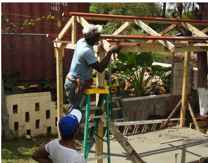
BMR Jamaica Wind staff construct a gazebo at the Malvern Health Center.