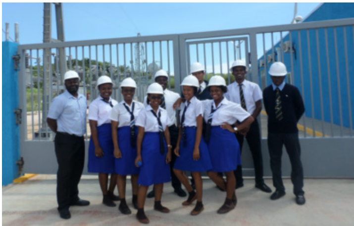
Munro College and Hampton School students participating in the avian monitoring program at BMR's Jamaica Wind Farm.