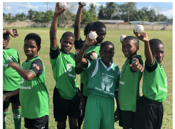
Students from St. Elizabeth and Kingston participate in the baseball clinic.

The Jamaica Institute of Sports (INSPORTS), U.S. Embassy, the American Chamber of Commerce, the Jamaica Baseball Association and Jamaica Little League Baseball also contributed to the event.