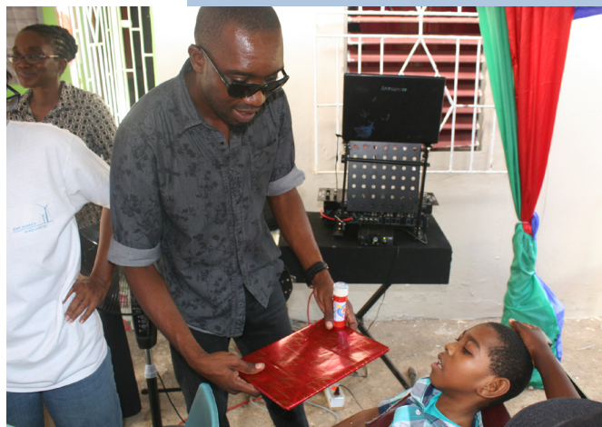
A BMR staff member distributes gifts at Rehabilitation Jamaica.

Center in Jamaica, local farmers around our Jamaica Wind Farm and others.