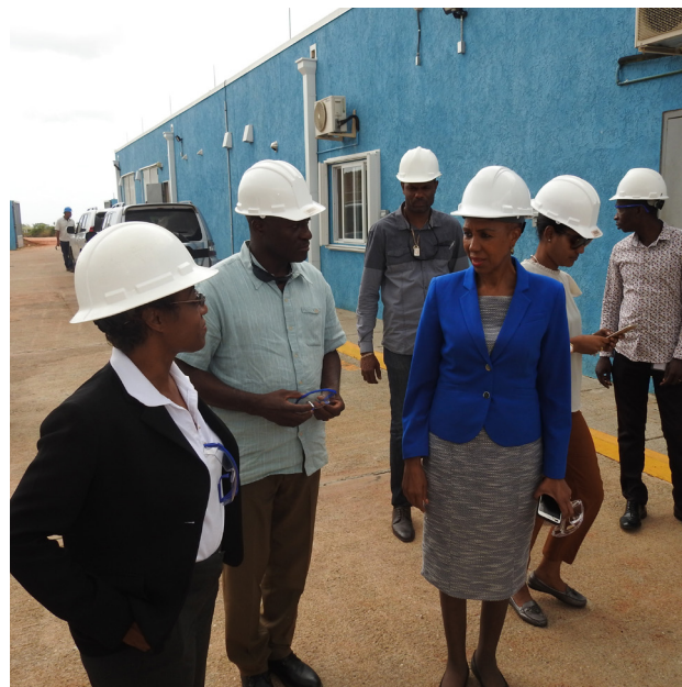
Hon. Fayval Williams visits BMR's Jamaica Wind Plant.

Fayval Williams, Jamaica's Minister of Education, Youth and Information; Former Minister of Science, Energy and Technology