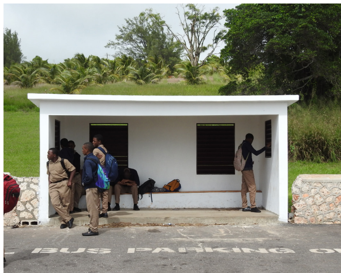
Munro College students gather at the completed new bus stop.

Later, BMR installed a retaining wall and a bus offloading area to serve the students of another local educational institution, Munro College. The offloading area provided students arriving via bus with a safe walkway, and a permanent bus shelter for students to use while awaiting transport.