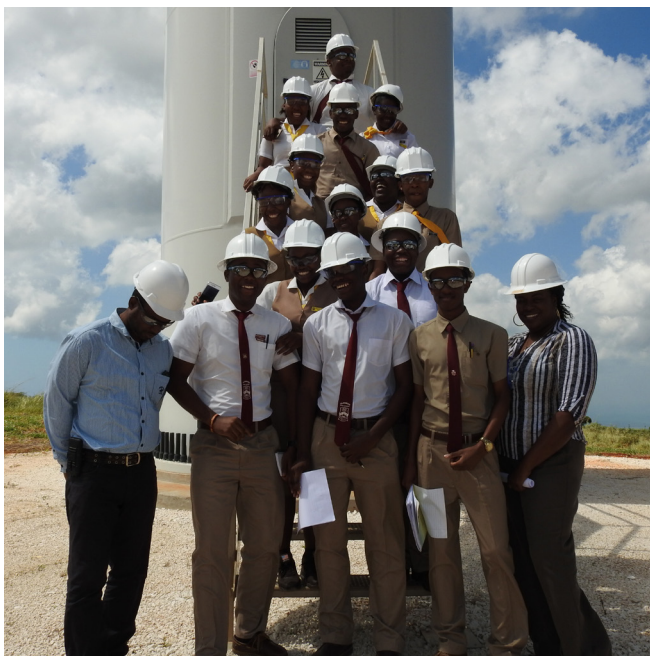
Students participating in the Petroleum Corporation of Jamaica's School Energy Program, in front of a turbine at BMR Jamaica Wind.

BMR participates regularly in annual initiatives that promote interest in the renewable energy field among Jamaican youth, both independently and in conjunction with the Petroleum Corporation of Jamaica's School Energy Program. Each year, our Jamaica Wind Farm hosts scores of students from local secondary and tertiary schools, giving them the opportunity to learn about wind energy and the plant's operation.