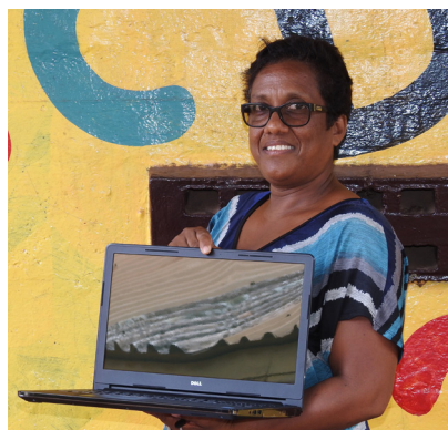
Laptop donation to Top Hill Primary School.

Each year, BMR donates laptops, tablets, computers and other internet-supporting devices to educational institutions in St. Elizabeth Parish, Jamaica.