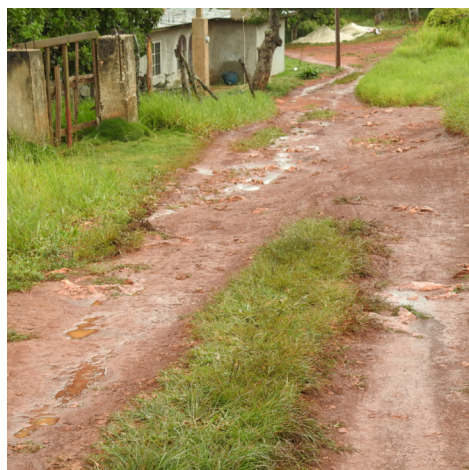
A section of Smithfield Road, a road near BMR's Jamaica Wind Farm, before it was repaired and paved.